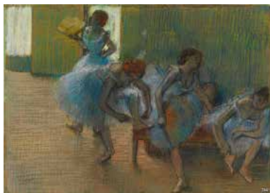
Dancers on a Bench by Edward Degas

Pupils will be introduced to a wonderful selection of Impressionist works on display. They will learn about the well-known artists associated with this movement, the techniques they used and have a chance to experiment with a selection of materials to create their own Impressionist-inspired artworks. They will also be introduced to art and design terminology to support critical studies.