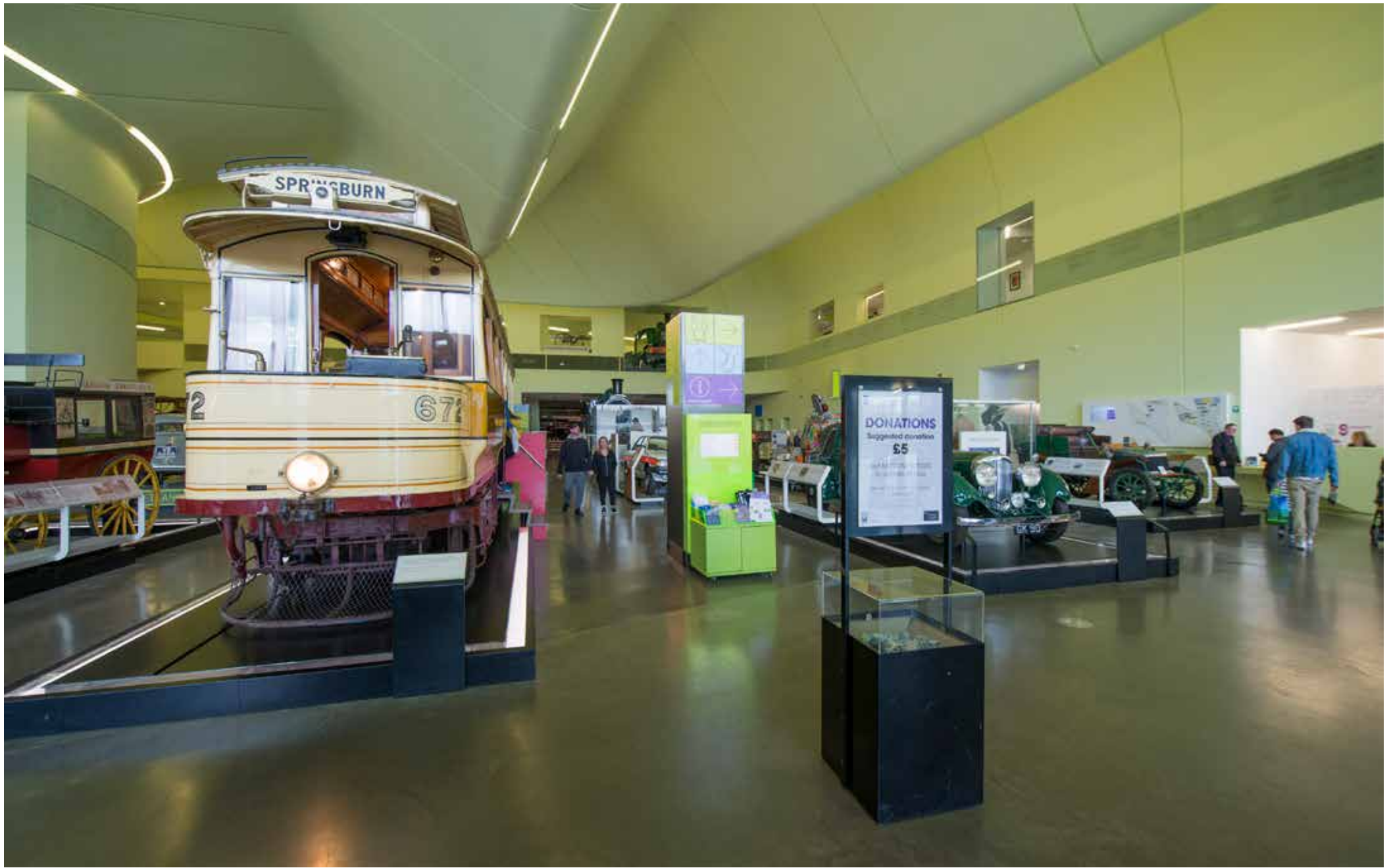
There are lots of objects in a relatively small space.