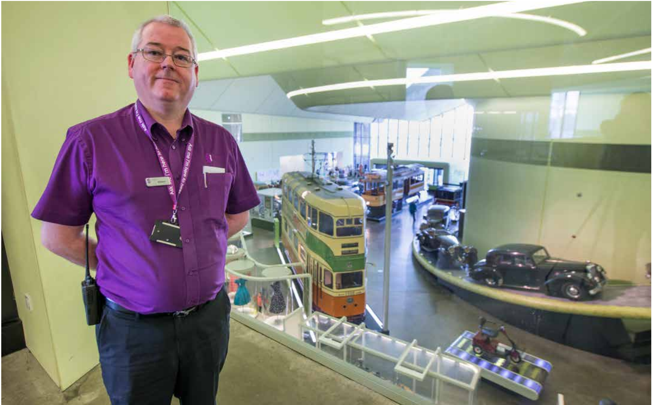
There are large windows like this one.