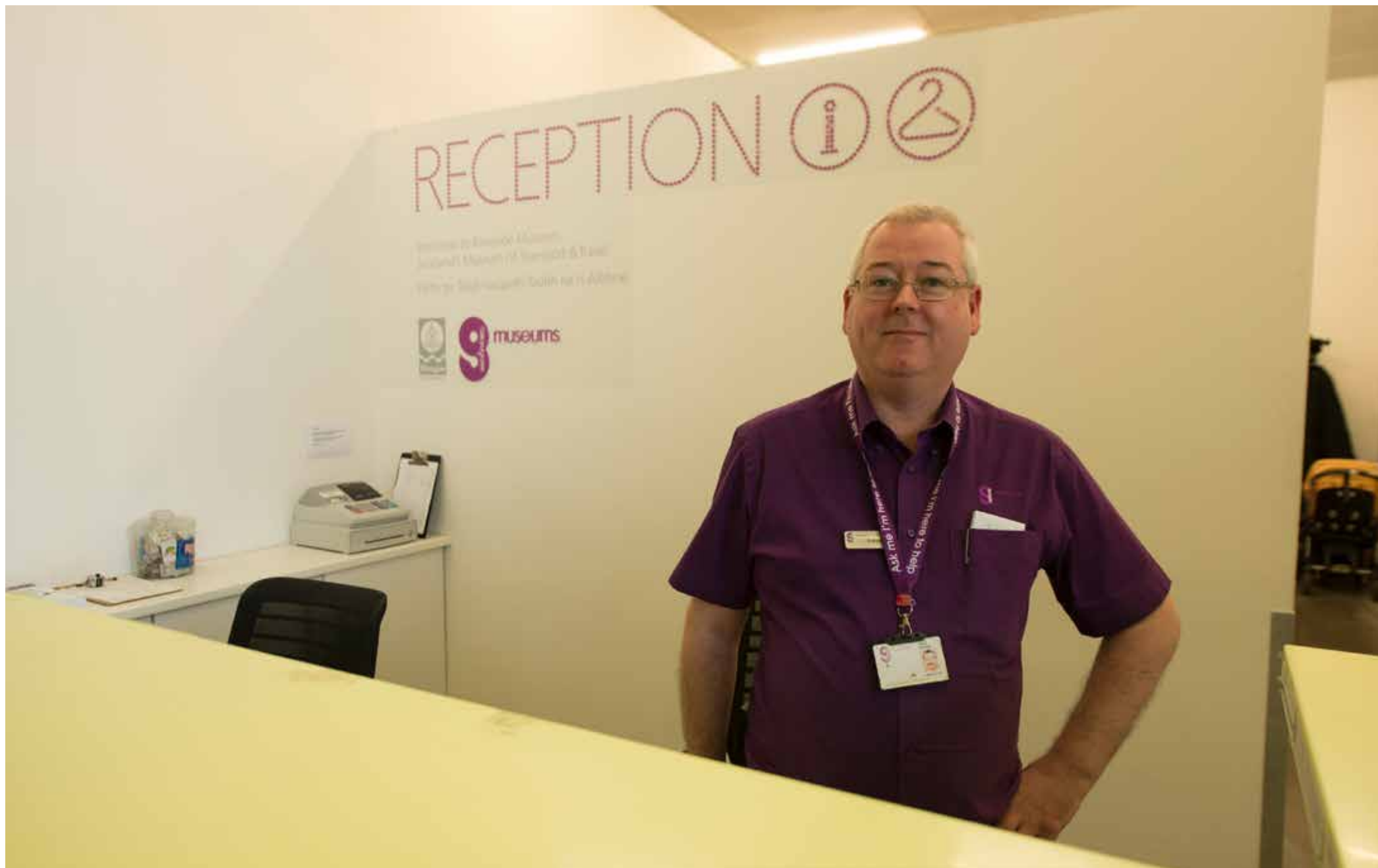
The reception is to your right. A gallery assistant can help you.