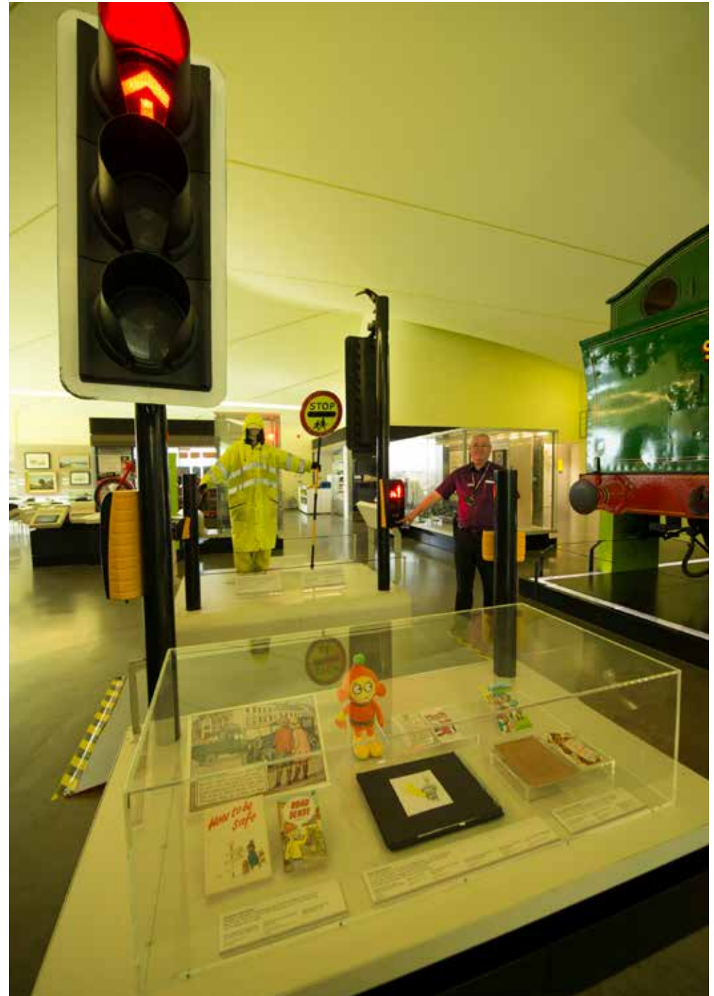
This is upstairs. The road crossing display is noisy and busy.