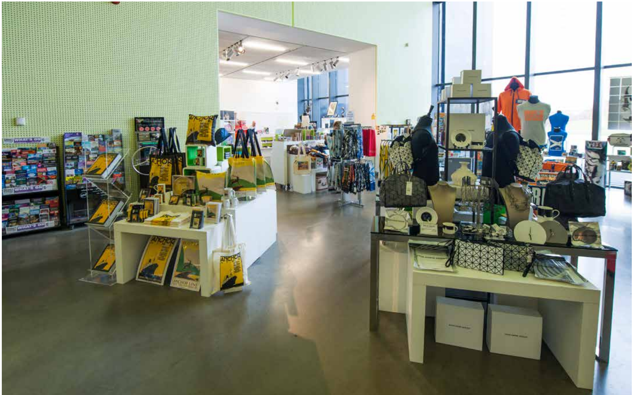
The museum shop is to your right. You can buy gifts here.