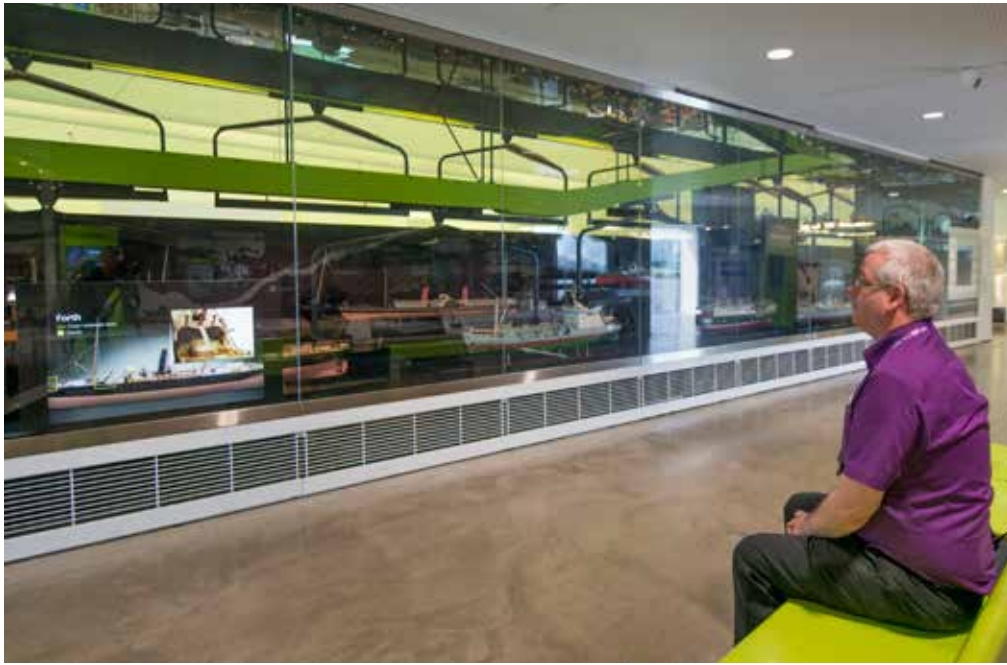
This is upstairs. You can sit and watch the ships go by.